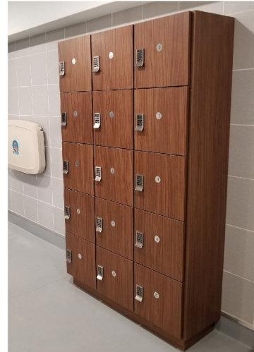
CONTACT FOR INSTALLATION AVAILABILITY